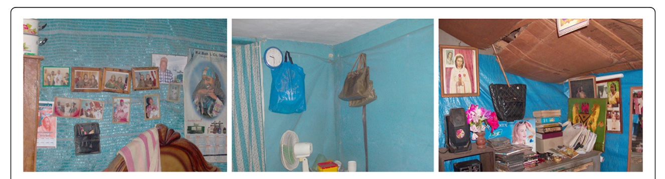
Figure 2 Examples of prototype DL (left), wall netting (middle) and ITPS (right) materials installed in houses in Enugu, Nigeria.

A total of 178 households in Lagos (61), Enugu (60) and Kano (57) were recruited to receive one of the three prototype lining materials. Ninety-one of these were rural houses while the rest were in urban areas. DL was installed in households in rural Lagos (31/61), urban and rural Enugu (10/60 and 15/60, respectively) and urban and rural Kano (9/57 and 15/57, respectively). Wall netting was only installed in urban houses in Lagos (15/61), Enugu (10/60) and Kano (9/57). ITPS was distributed to households in urban Lagos (15/60), urban and rural Enugu (10/60 and 15/60, respectively) and urban and rural Enugu (10/60 and 15/60, respectively) and urban and rural Enugu (10/60 and 15/60, respectively) and urban and rural Enugu (10/60 and 15/60, respectively) and urban and rural Enugu (10/60 and 15/60, respectively) and urban and rural Enugu (10/60 and 15/60, respectively) and urban and rural Enugu (10/60 and 15/60, respectively) and urban and rural Enugu (10/60 and 15/60, respectively) and urban and rural Enugu (10/60 and 15/60, respectively) and urban and rural Enugu (10/60 and 15/60, respectively) and urban and rural Enugu (10/60 and 15/60, respectively) and urban and rural Enugu (10/60 and 15/60, respectively) and urban and rural Enugu (10/60 and 15/60, respectively) and urban and