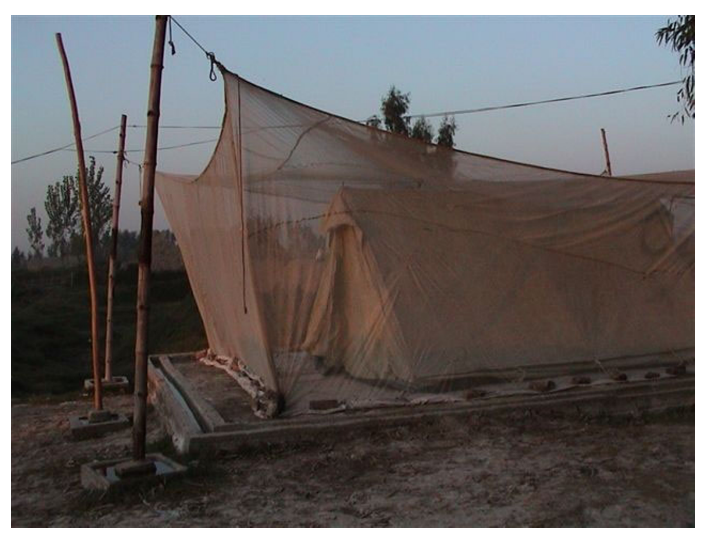
Figure 2 Tent erected in large trap net for overnight platform tests.

mortality. All mosquitoes were categorized as blood-fed or unfed, identified to genus level and the anophelines to species level.