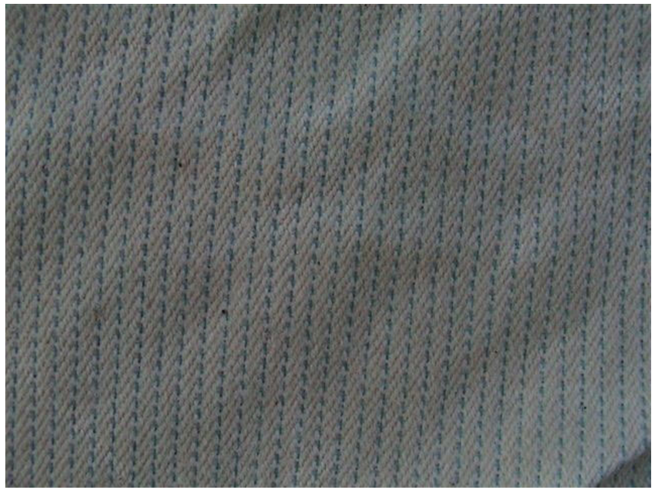
Figure I Close-up of tent material: canvas with delatemethrin-treated polyethelene thread woven through.

stephensi were exposed to the tent under the cones for three or ten minutes, after which they were held under insectary conditions ( 26 +/- 2^{\circ}C and 75 +/- 10% RH) and given access to sugar solution. Knock-down was recorded after one hour and mortality after 24 hours.