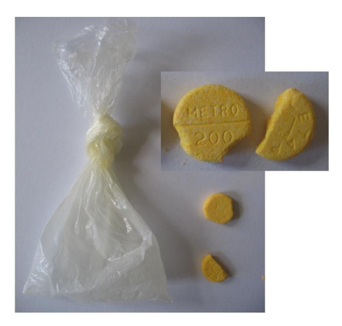
Figure 3 Tablets purchased as sulphadoxine/pyrimethamine in a shop.

licensed market to the illicit market, a procedure frequently observed in malaria endemic countries [8]. However, it is likely that the increasing demand for artemisinin and ACT drugs will be accompanied by increasing production and distribution of substandard and fake products in the near future [38]. There is already evidence for such a development from a study conducted in East and Central Africa on the quality of artemisinin and ACT drugs available at private pharmacies [39]. Reports from Tanzania and Cameroon also indicated the presence of counterfeit dihydroartemisinin and counterfeit artesunate in the African market [38]. As a consequence, appropriate anti-malarial drug surveillance needs to become established in all countries of SSA. In addition, governmental drug control authorities need to be strengthened, access to affordable, quality controlled drugs needs to be improved, and the population should become better informed on the risks associated with buying drugs at the illicit market.