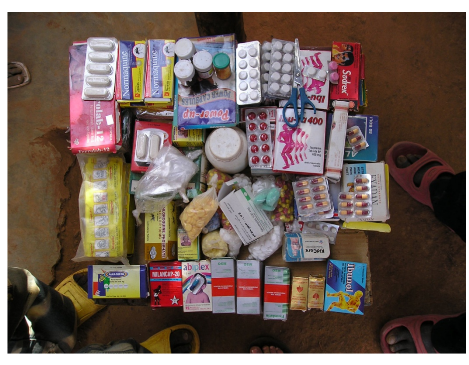
Figure 2 Drugs sold at an illicit market of Burkina Faso.

stances. Poor disintegration is considered an important, but neglected problem in the field of drug quality [30].