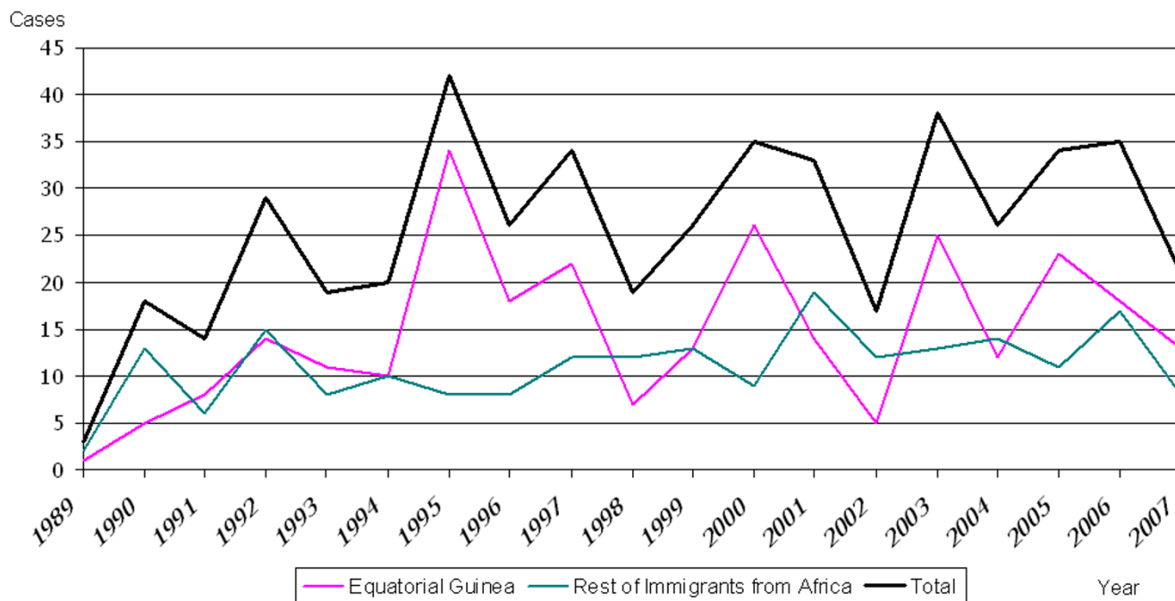
Figure 2 Evolution of the recorded malaria cases. Patients from Equatorial Guinea compared to other Africans. Barcelona, 1989–2007.

the rest of Africa. Moreover, it was possible to observe that this group requires less hospitalization and visited the specialized center in the Inner City (UMTSID) more often, even though they live in less economically disadvantaged neighbourhoods (Table 2).