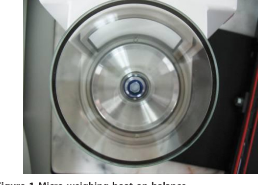
Figure 1 Micro weighing boat on balance.

The balance has an uncertainty at the 1 mg level of \pm 0.0013 mg. The balance is calibrated annually with traceable weights by an accredited company. The calibration certificate is kept on file and a copy can be obtained upon request. As an example, if the amount of 0.4000 mg is weighed it will introduce an error of less than \pm 0.33\% of the final result. The overall procedure used is based on Good Weighing Practice (GWP) principles and is described in internal standard operating