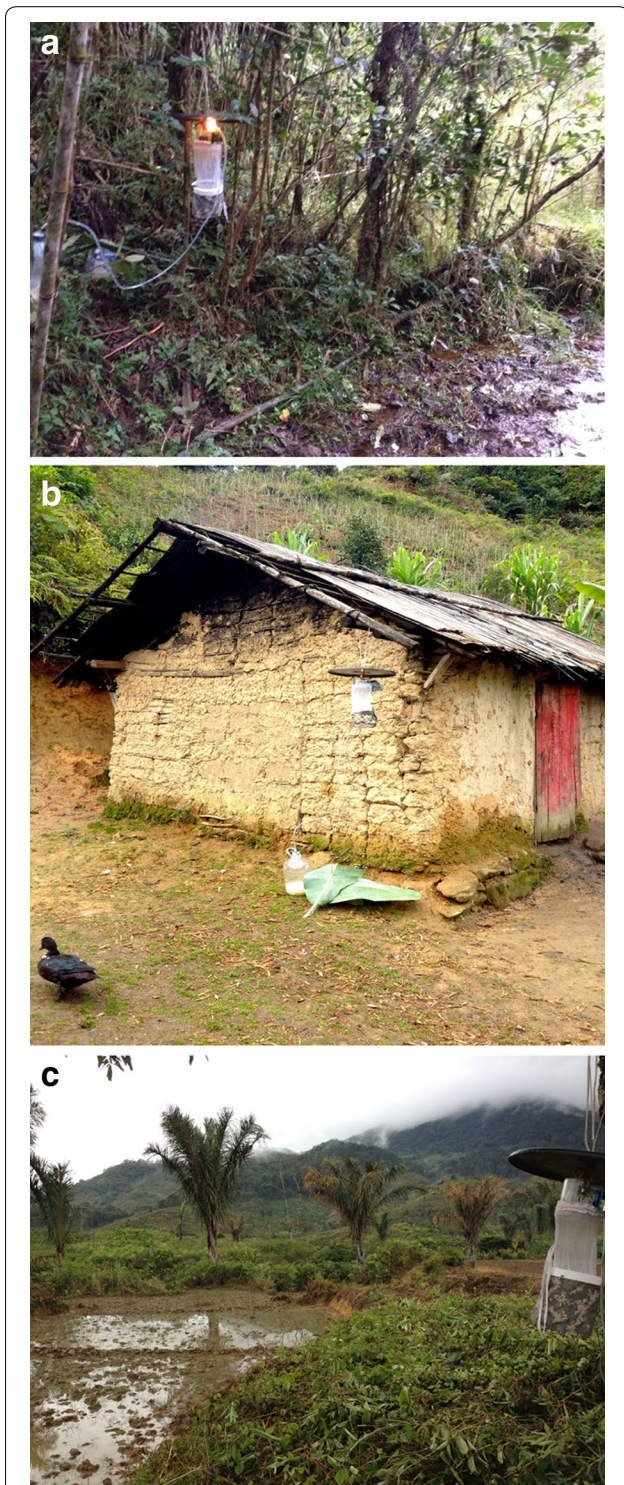
Fig. 1 Examples of trapping sites in and around six villages near Ranomafana National Park, Madagascar. a Forest-trapping site. b Village-trapping site. c Agricultural-trapping site

Data analysis was performed using SAS 10.1 ® (SAS, Inc., Cary, North Carolina). General exploratory data analyses and bivariate relationships of variables of interest were examined. Poisson Regression models were used to examine the relationship between the prevalence of Anopheles and variables in the study that may influence mosquito prevalence. The independent variables included in the model were: land-use, village, odour, moon illumination, precipitation, temperature and