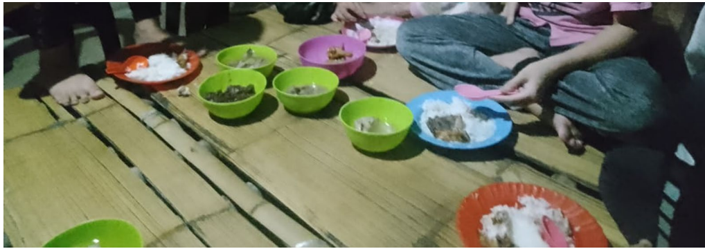
Fig. 4 “A simple dinner for my family at our home” [Female, Farmer, Kg Paradason]

think about who will take care of the children if he or she goes to the hospital. So people will stay home and not go to the clinic.” [IDI05].