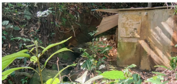
Fig. 2 “The “lokos”. We need to go there. Our main water source” [Female, Farmer, Kg Paradason]

to walk for almost 20 to 30 min to get to the area. They also pointed out that the area around the “lokos” and surrounding small ponds had many mosquitoes and larvae, making access to these areas a health risk (Fig. 2).