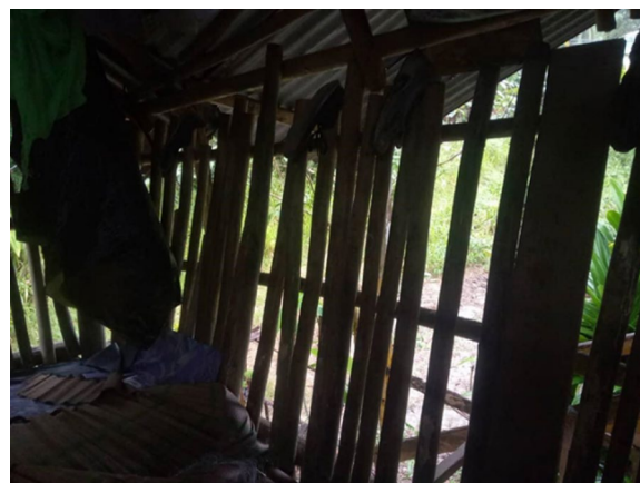
Fig. 3 “It always feels like night time here” [Male, Farmer, Kg Paradason]

Participants across all study sites described the inconsistency of communication signals in their villages due to the inaccessibility of internet lines, leading them to travel into areas where mosquitoes are present, which in turn put them at higher risk of malaria. This limitation leads villagers to search for “line hotspots” in various locations, such as near the forest, in the plantation area, or on the hills, for instance, in Kg Membatu Laut, villagers have sometimes been able to get an internet signal from Pitas, a district located on the right side of Kudat and separated by Marudu Bay (see map in Fig. 1).