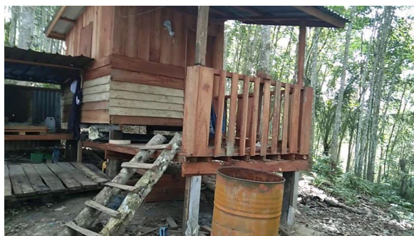
Fig. 7 "A "sulap" in a farm" (Female, Housewife, Kg Paradason)

Participants highlighted issues with the smells produced by mosquito control items that conflicted with their work. For example, some participants explained the difficulty of using repellents during activities like hunting. Participants explained that hunters often would not put on mosquito repellents as the products produced a smell that made the animals avoid the area as they could sense the smell from afar. Likewise, the hunters would not bring bed nets, as they need to be mobile.