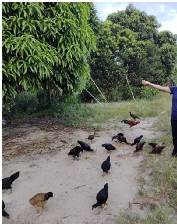
Fig. 5 “Feeding chickens is a routine for some of the villagers here” [Female, Self-employed, Kg Membatu Laut]

“I asked them (the researchers and officers from many organizations), can we shoot the monkeys? We wanted to kill them because these animals (monkeys) disturbed our farms. They replied, ‘You cannot kill them [...], so when they answered as such, what can we do? So, you see, no one is taking care of this issue. Do we leave the issue here? Let the monkey disturb our farm. Can anyone help us and take some action? The paddy (padi) and corn took a year to grow and were supposed to be the food source for a year. However, they were destroyed by the monkeys.’ [Community leader, Kg Membatu Laut] [IDI04].