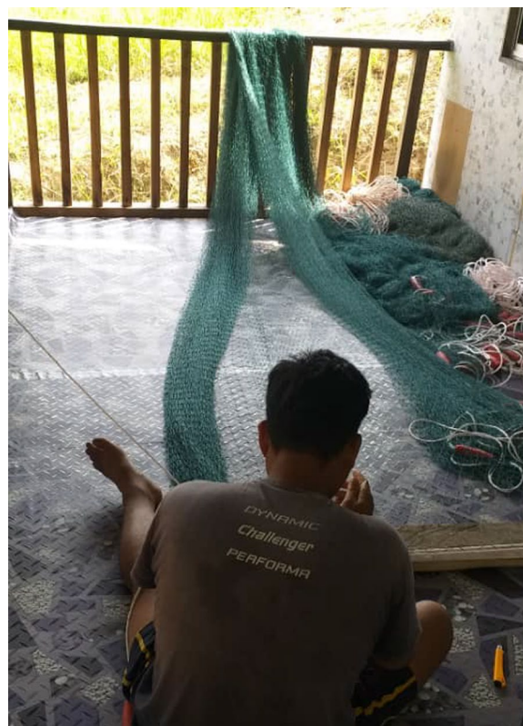
Fig. 6 “One activity the people in our village do is tending to their fishing nets from evening to night time after they returned from the sea” [Female, Farmer, Kg Membatu Laut]

The second important theme generated from the research data was the challenges to malaria prevention due to local socio-economic structures and practices. The communities are commonly exposed to malaria based on the sections they work in. For example, most people worked in the agricultural sectors such as rubber tapping, picking coconuts, working in oil palm plantations, and farming. Other livelihood activities were fishing, finding non-timber products in the forest, and breeding chickens. These