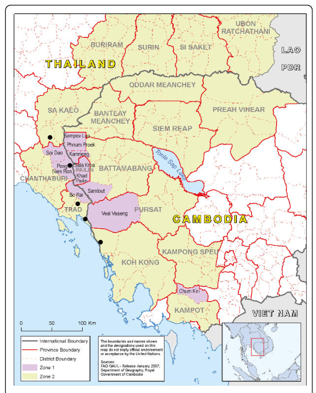
Figure 1 Location of the 5 study sites. Falciparum resistance to artemisinin has been documented in the hotspot Zone 1 where intensive containment operations are ongoing.

The study staff members were health care workers in the study areas and were trained on RDS methodology. After preliminary interviews with the migrants in the communities, the staff selected six seeds per site for a total of 30 seeds, with a goal of reaching the sample size needed in approximately two months. These seeds were given three