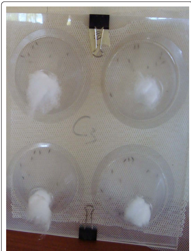
Figure 1 Photograph of the WHO cone bioassay setup. Photograph shows how the cones were suspended between two plastic sheets with holes in, with the mosquitoes directly contacting the netting. Fine mesh netting (best seen in the bottom of the photo) was used behind the treated net to prevent mosquitoes escaping.

regression analysis was carried out. Confidence intervals of the proportions were calculated using the normal approximation interval model. For the cone bioassays, the replicates were not significantly different from each other, so the data were pooled. For survival analysis, differences between the control and fungus-exposed mosquito survival rates were investigated using Cox' regression analysis. Mortality rates were given as hazard ratios (HR), which gives the average daily risk of dying relative to the control. All statistics were carried out in SPSS 17.0 [30] with \alpha at 0.05.