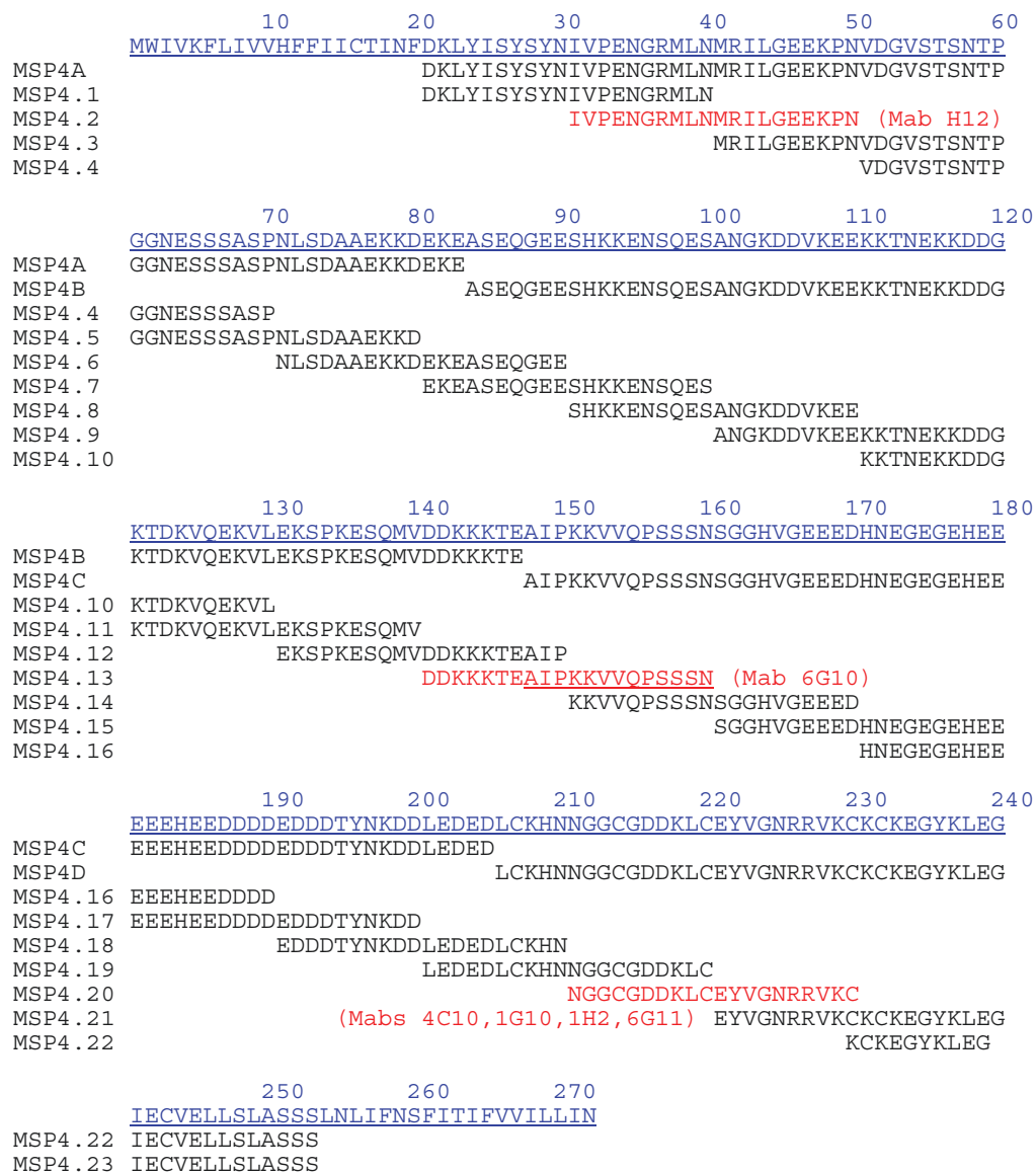
Figure 1 Location of Mab epitopes within the MSP4 amino acid sequence. Full amino acid sequence of MSP4 (blue) is aligned with the sequences corresponding to four recombinant fragments (MSP4A: amino acids D 21 -E 83 ; MSP4B: A 84 -E 147 ; MSP4C: A 148 -D 203 ; MSP4D: L 204 -S 248 ), and 23 synthetic peptides (MSP4.1 - MSP4.23). The epitopes for a number of Mabs are indicated in red within several of the peptides: Mab H12 (MSP4.2), Mab 6G10 (MSP4.13), and Mabs 4C10, 1G10, 1H2, 6G11 (MSP4.20).

in Freund's incomplete adjuvant 21 and 34 days later. Serum was tested after the final immunization by ELISA for the presence of anti-MSP4 antibodies. A final boost of 25 µg protein in PBS was given and three days later the mice were killed and spleen cells fused with SP2 myeloma cells and hybridomas selected as described previously [14]. Anti-MSP4 antibodies were screened for reactivity to the immunizing antigen by ELISA. Reactivity to native protein was also assessed by immunoblotting 3D7 extracts and by indirect immunofluorescence assay (IFA) to fixed merozoites [15]. Monoclonality was