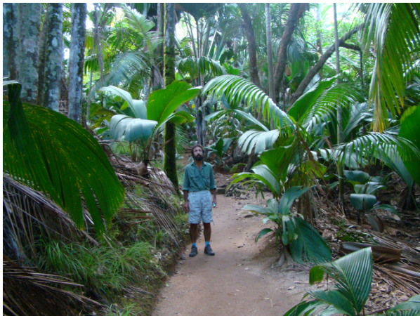
Figure 3 Photo of Vallée de Mai, Praslin Island. Note the flora, composed largely of palm trees.

on at least two occasions, with the most recent complete submersion occurring c.125,000 years ago [10-12]. Aldabra is a huge atoll (155 km 2 of emerged land) of 34 km long, 14.5 km wide; it consists in raised coral of up to 8 m above sea level (Figure 4), and comprises 4 main islands enclosing a central lagoon of 224 km 2 [13]. The greatest colony in the world of giant tortoises ( Testudo gigantea ) is found at Aldabra, with up to 150,000 individuals. The avifauna is very diversified for both landbirds and seabirds, the latter being most abundant in the mangroves and islets around the lagoon [14].