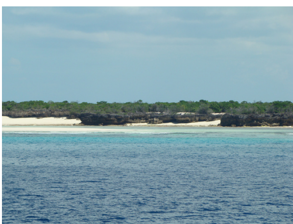
Figure 4 Photo of Aldabra Atoll, Island of Grande Terre. Note the low elevation of the coralline island rising just above sea level. The local peak is at 18 m a.s.l. (a sand dune) and the average altitude is between 2 and 3 m. (Photo V. Robert/IRD).

The climate of the coralline islands is rather different from the granitic islands. For instance, on Aldabra, from April to October, the trade winds blow from the south-east and carry relatively dry and cool air, with minimal