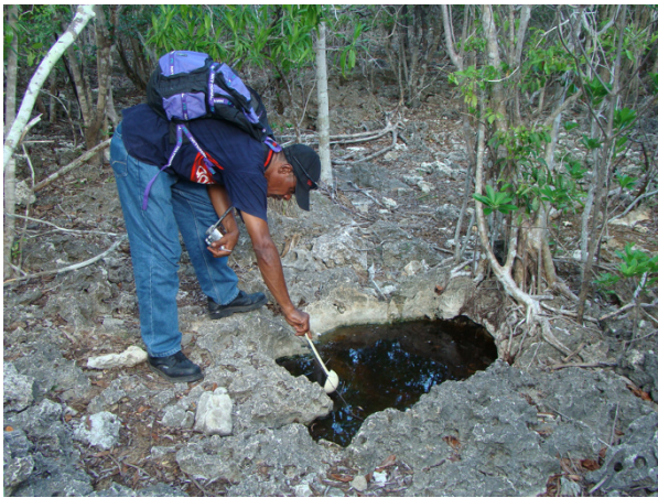
Figure 5 Photo of mosquito larvae collection, Aldabra Atoll, Picard Island. Note the larval breeding places are mainly natural and composed of coral rock pools inundated by rainwater.

mosquitoes at least on the granitic islands and to a lesser extent in the Amirantes archipelago. Two hypotheses can explain this absence of anophelines: (i) no natural colonization or introduction, and (ii) introduction did not result in the establishment of a viable breeding population.