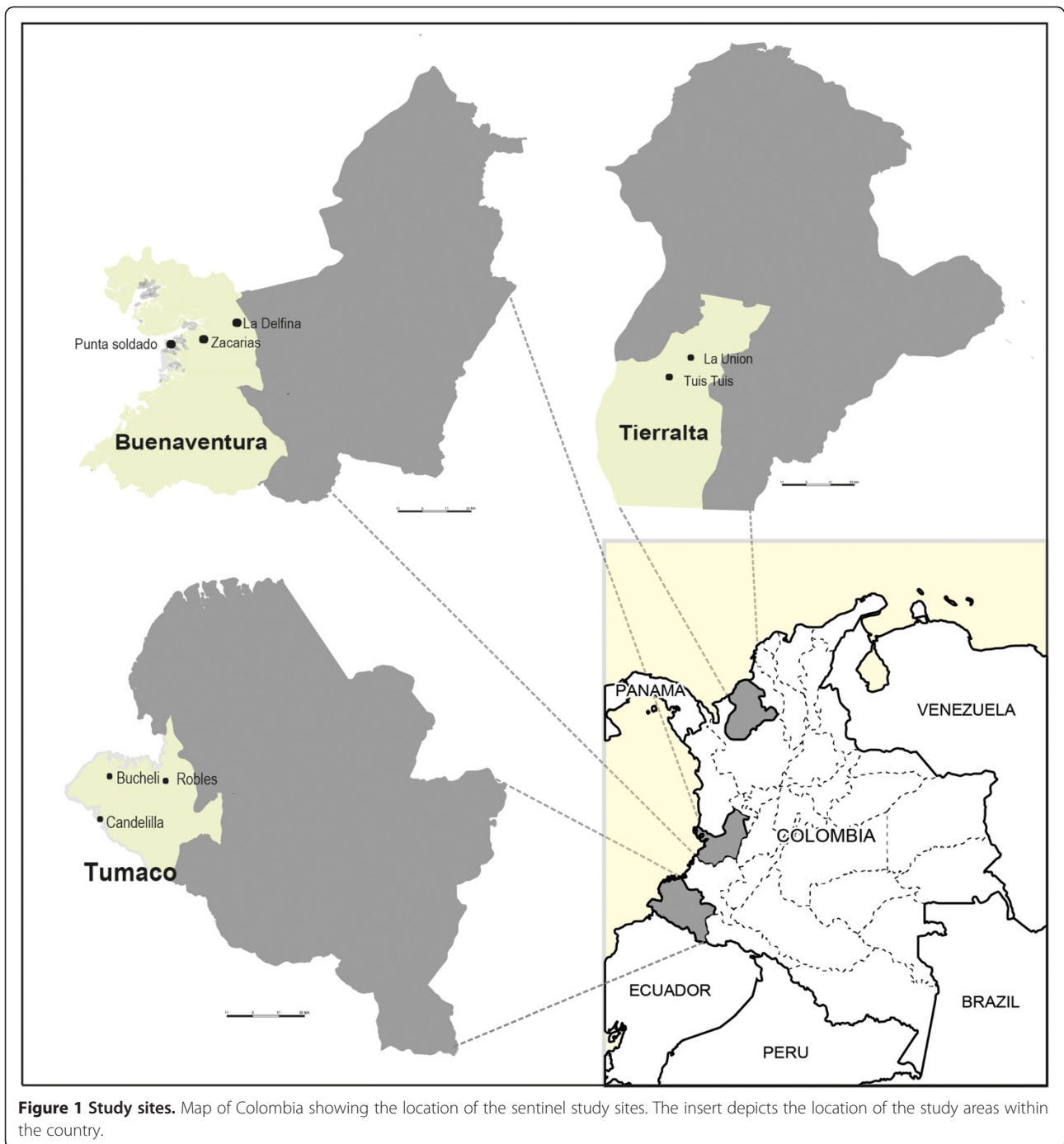
Figure 1 Study sites. Map of Colombia showing the location of the sentinel study sites. The insert depicts the location of the study areas within the country.

first, a door-to-door census of the entire population of each sentinel site; and the second, a survey using a structured questionnaire carried out by trained field workers. The survey was directed to heads of households in a subset of randomly selected houses. The same team of trained physicians accompanied the local teams to all eight sentinel sites. The trial was conducted according to Declaration of Helsinki principles, International Conference on Harmonization, ICH E-6 Guidelines for Good Clinical Practices and all