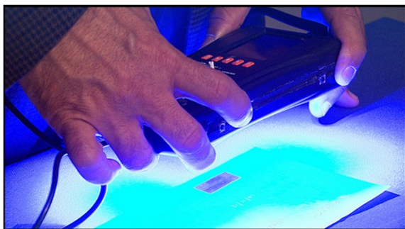
Figure 3 Counterfeit Detection Device (CD-3) [60].

Malaria continues to be a massive global public health problem and it is prevalent in 104 countries. It has been estimated that nearly half of the world population (3.4 billion people) is at risk [25,26]. Although it is a preventable and curable illness, it remains one of the most important causes