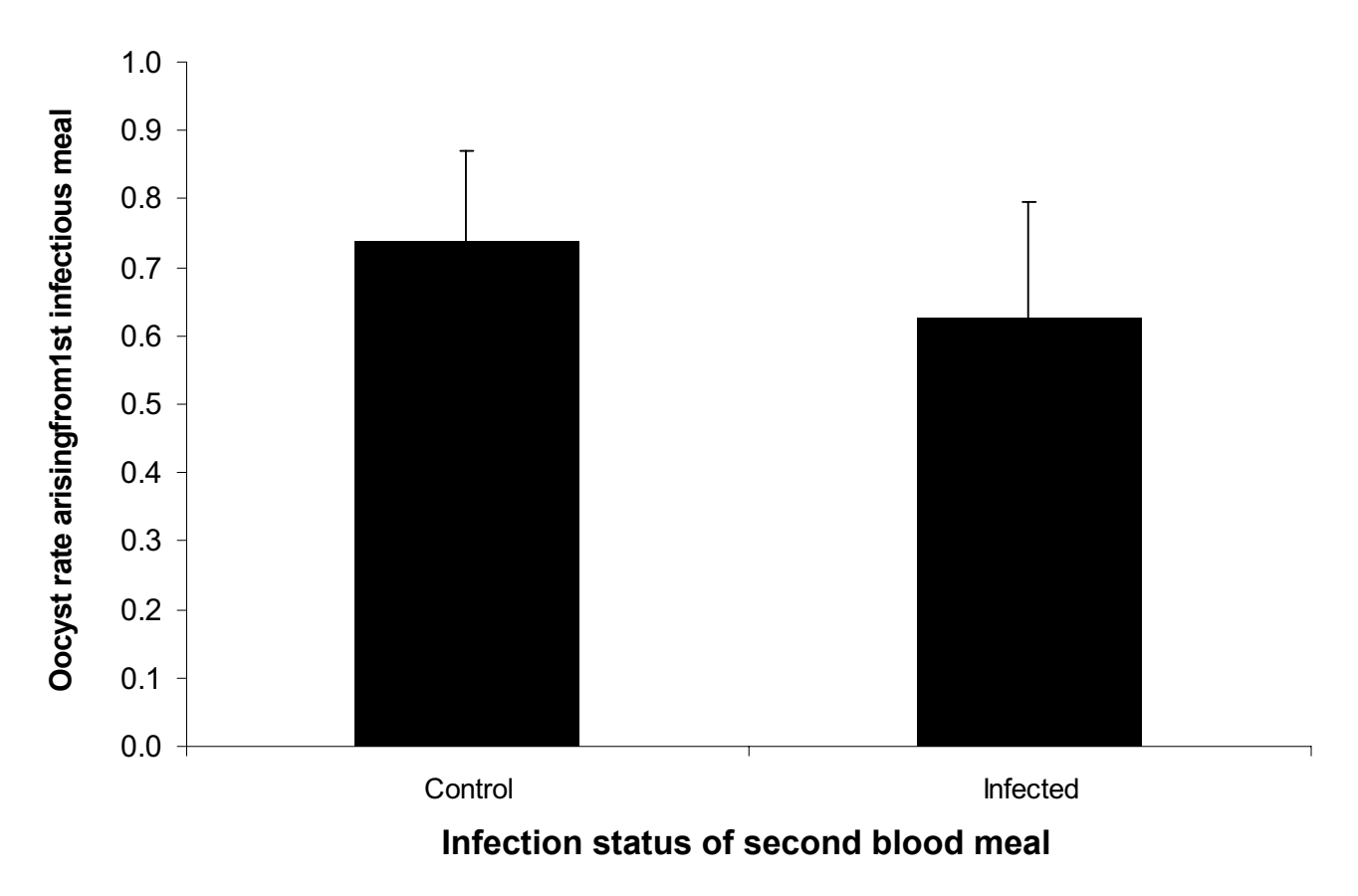
Figure 2 Proportion of mosquitoes that were initially fed infected blood that developed oocysts as a function of the parasite status of a second blood meal. The second blood meal was given to mosquitoes four days after the first. The data represent the average infection rate across 3 trials (51 mosquitoes), with bars indicating one standard error.

rogonic cycle cannot be ruled out. Indeed, we only tested for a negative development effect of super-infection over a limited period of the sporogonic cycle (oocyst development between day 4 and 7). Had we tracked infection success through to the sporozoite stage, we may have detected a developmental effect of superinfection. Malaria parasite growth in mosquitoes can be hindered by subsequent infection with filarial worms [47], and this may have happened here at a later stage of infection. Additionally, this study was restricted to examining the development of a first Plasmodium infection in the presence of a second (not the development of a second infection in the presence of the first). Thus we have only described the fitness consequences to one party in the super-infection. Although the successful development of a first infection may not be hindered by a second, it is possible that the second cannot develop in the presence of the first. Quantitative PCR protocols to track the relative frequencies of primary and superinfecting clones in sporozoite popula-