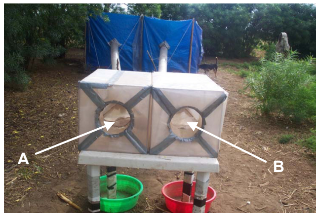
Figure 1 Odour Baited Entry Traps (OBETs) from the tents with different baits. Trap A with a cattle and B with human, both of the same weight.

The behaviour of An. arabiensis was assessed in this paper by using three different ways. First by using experimental huts, where the resting behaviour of An. arabiensis was assessed and compared with other species common in the community ( An. gambiae and Culex quinquefasciatus ). Second by using odour-baited entry traps: OBETs (see figure 1) involving humans and four different animals usually kept in the community (cattle, goats, sheeps and pigs). Mosquito behaviour was also assessed by using HBI comparing the feeding behaviour of mosquitoes in three different communities.