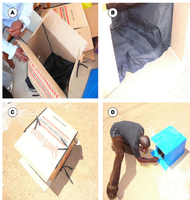
Figure 1 Photographs of the standardized resting boxes (SRB) used in this study. Panels A and B illustrate how the boxes are made, panel C demonstrates the way to install them, and panel D demonstrates how to recover resting mosquitoes.

A new device for outdoor sampling adult mosquitoes called the Ifakara tent trap-B (ITT-B) has been developed and evaluated in both rural and urban Tanzania [8]. This trap operates passively all night long without skilled personnel and is designed to prevent exposure of the human volunteer that acts as bait by sleeping inside it. Field studies, in both rural Kilombero Valley and urban Dar es Salaam, have established that the new trap is efficacious in the sense that it has sufficient sensitivity to represent a viable alternative to HLC [8]. This study evaluated the effectiveness of the ITT-B and SRB relative to that of the HLC under field conditions of the Dar es Salaam's UMCP.