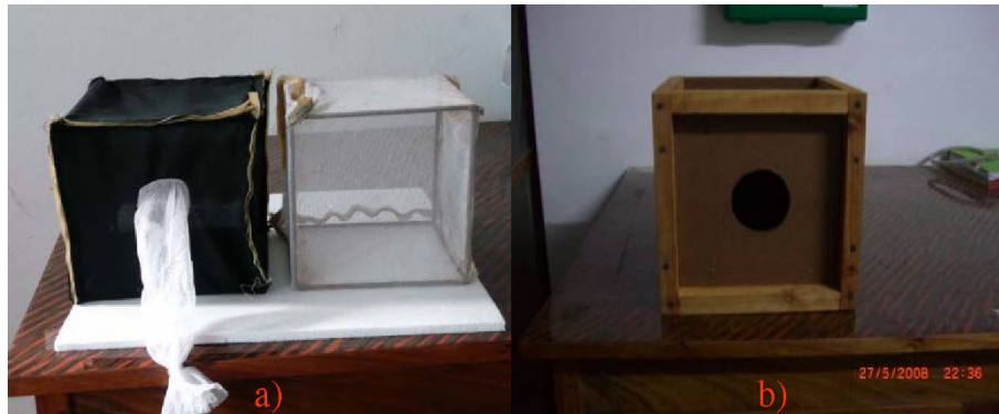
Figure 1 A photograph of a) black cloth and netting cages, b) cage made with mud-lined panels.

The fungal solution was applied to the delivery surfaces using a hand-held air compressor sprayer (Minijet®, SATA, Germany) held 50 cm away and at a right angle to the surface. About 23 ml of fungal formulation ( 2 \times 10^{10} conidia m^{-2} ) was applied onto each of the surfaces. Treated materials were left to dry for 48 h. Sections of netting and black cotton cloth were then joined using Velcro strips, to fit over 20 \text{ cm}^3 wire frame cages. Mud-lined plywood panels were assembled into 20 \times 20 \times 20 cm cages. Mosquitoes were then exposed to the treated surfaces (Figure 1) as described in the bioassay procedures below.