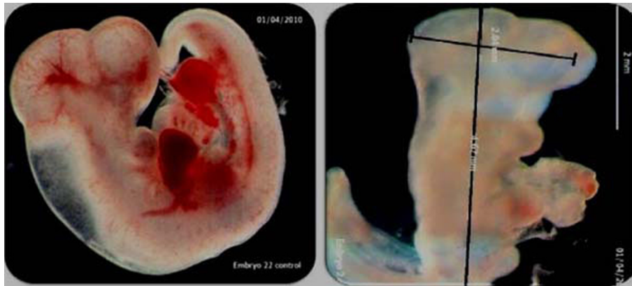
Figure 2 In vitro Control (L) and Artesunate-treated (0.5µg/mL) gestation day 12WECs at 72hr.

Embryonic blood was collected for haematological analysis and de novo blood vessel formation of blood vessels in the yolk-sac was also assessed.