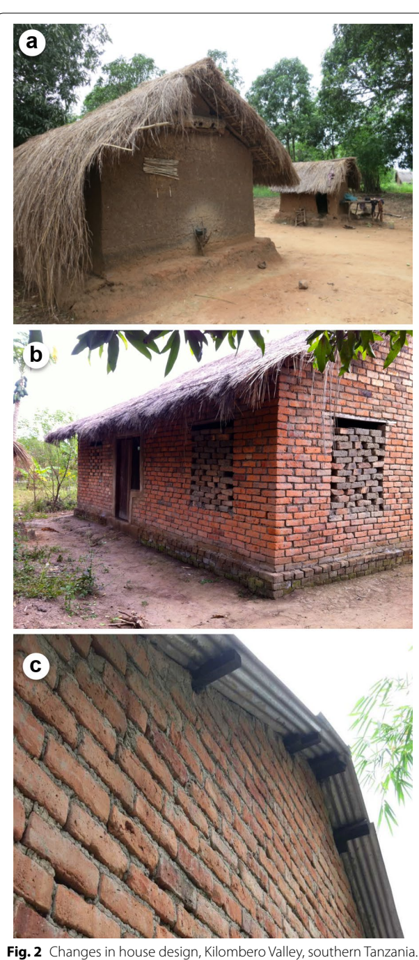
Fig. 2 Changes in house design, Kilombero Valley, southern Tanzania Traditional mud wall and grass thatch houses ( a ) are being replaced by grass thatch and (burnt) brick wall houses ( b ) and subsequently corrugated iron sheet roofing is installed ( c )

Knols et al. Malar J (2016) 15:404 Page 4 of 7