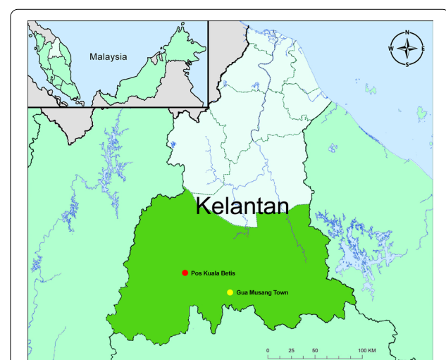
Fig. 1 Map of Gua Musang District (dark green) in the State of Kelantan, Malaysia where surveillances were conducted. The study site in Pos Kuala Betis is located approximately 40 km from Gua Musang town

The study was conducted in Pos Kuala Betis (latitude 4°53'22"N; longitude 101°45'30"E), a cluster of five villages (Angkek, Betak, Sri Galas, Lambok and Podek) located at the Gua Musang district, Kelantan state, Peninsular Malaysia (Fig. 1). The Temiar sub-tribe of the Senoi was known to be the main indigenous Orang Asli in these villages. Located approximately 40 km from Gua Musang town, the typical climate of the study area is tropical monsoon with temperature ranged between 20 °C and 32 °C and average annual rainfall between 2000 mm