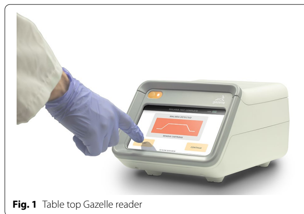
Fig. 1 Table top Gazelle reader

A point-of-care portable magneto-optical device, Gazelle was also used for malaria diagnosis. Gazelle comprises a reader (small, tabletop) and single use disposable cartridges (Fig. 1). Prior to running samples, a positive and negative control was run on the reader to ensure appropriate functioning. As per manufacturer's instructions