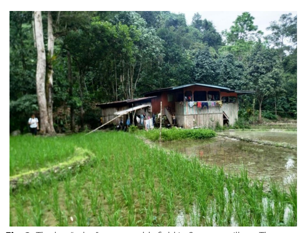
Fig. 3 The hut "sulap" near a paddy field in Sosopon village. The paddy field is surrounded by dense forest. Water is accumulated in the field possibly a good environment for mosquito reproduction

This survey revealed that when the villagers experienced fever, they prefer to self-treat with antipyretics. This finding is underlined by the fact that all malaria cases identified by ACD had mild symptoms, but they did not seek treatment in healthcare facilities. Furthermore, respondents had no misconceptions regarding malaria transmission but were reluctant to use preventive measures. High-risk behaviour leading to exposure to malaria indicates the need to perform qualitative research to explore the villagers' understanding of malaria transmission and their belief toward the disease [24-27], which is critical to the success and sustainability of community-based malaria programmes [28]. Anthropological parameters cannot be ignored in malaria control initiatives [25, 28]. Previous studies have shown that misconceptions regarding malaria epidemiology, poor usage of preventive tools for the