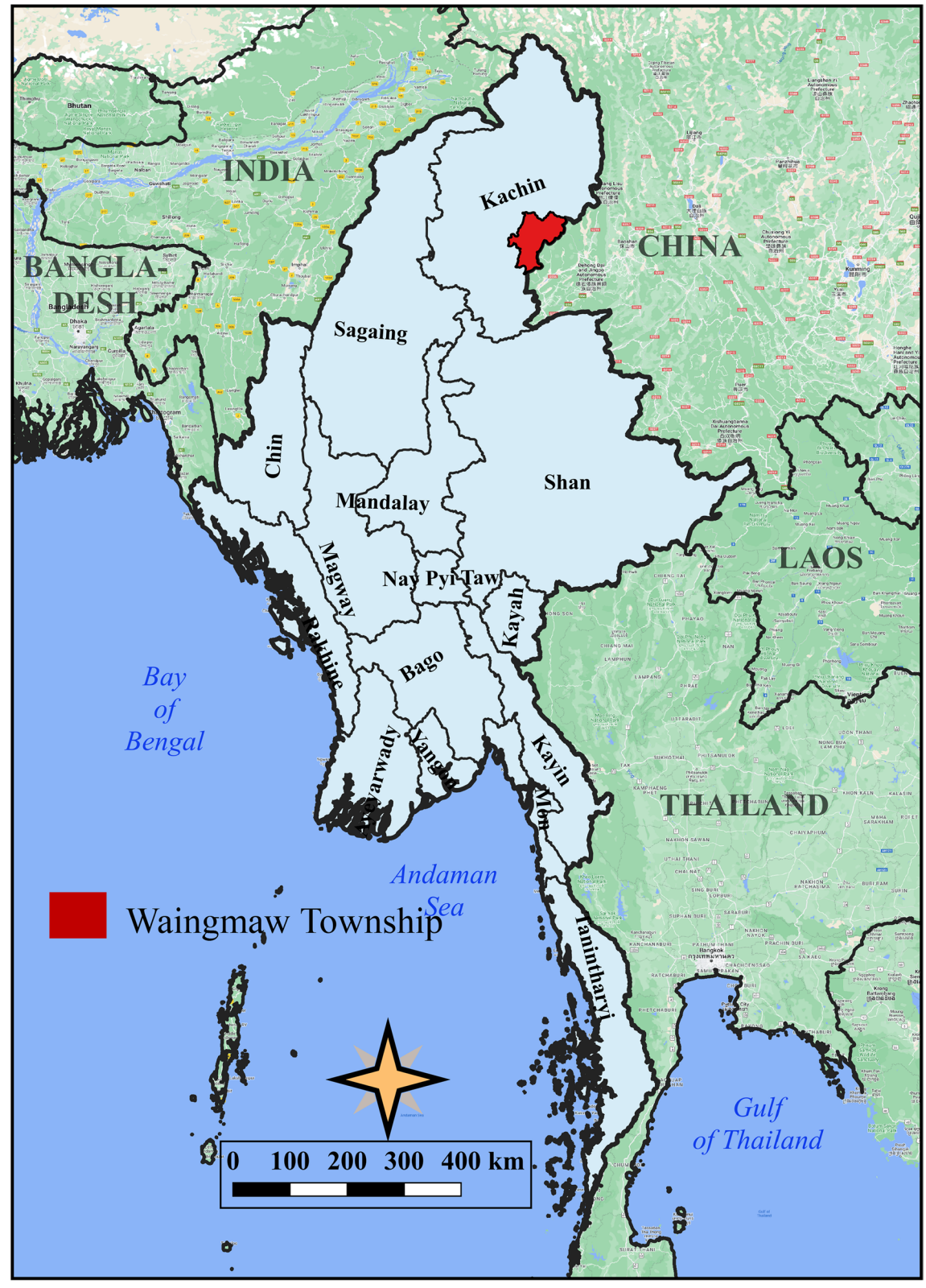
Fig. 1 Map of the study township in northern Myanmar