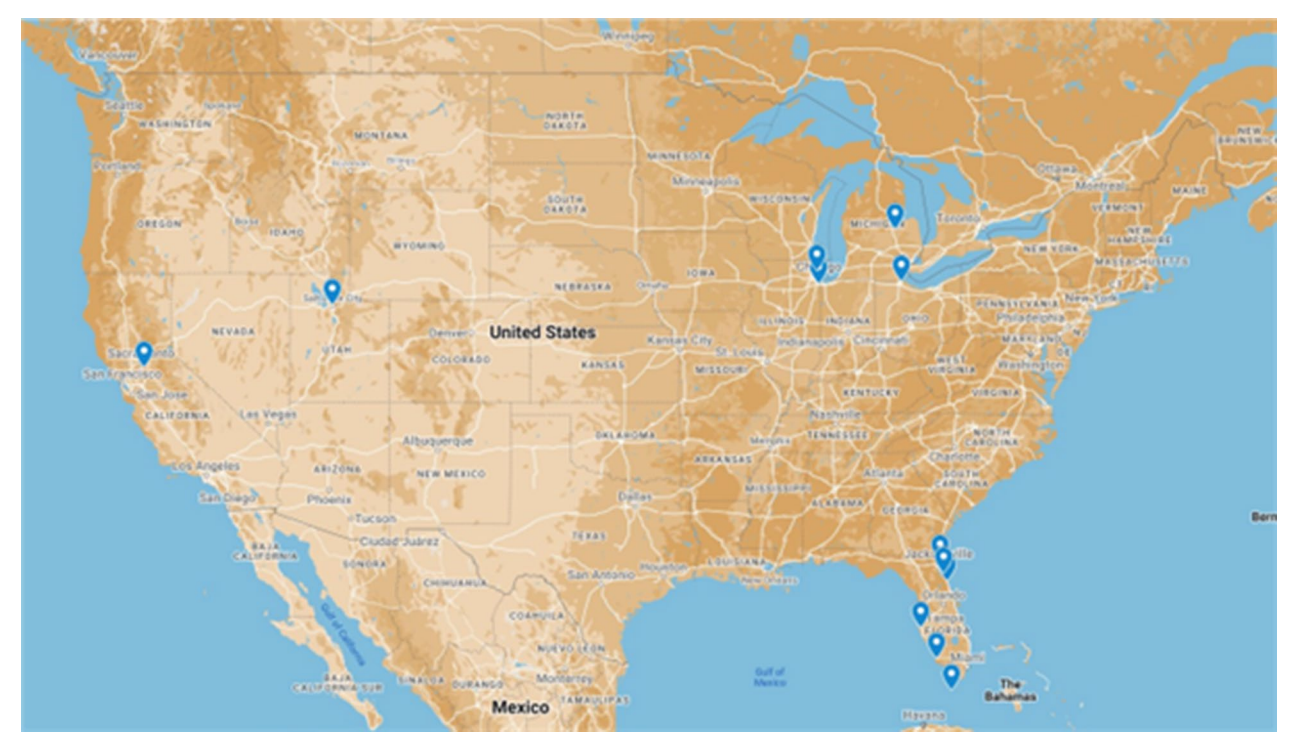
Fig. 1 Map of the United States showing the locations of the abatement programmes visited by the delegation from PAMCA

In June 2022, thirteen members of the PAMCA delegation visited the South Cook County Mosquito Abatement District (SCCMAD); Clarke Mosquito Control (Clarke Mosquito Control serves as both a supplier of mosquito control products, but also as an operational mosquito control service provider contracted by municipalities to provide all mosquito control services in a given jurisdiction); and North Shore Mosquito