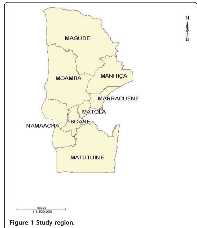
Figure 1 Study region.

Collected malaria data comprises records of number of episodes occurring in years 1999 to 2008, provided by provincial health directorate. After data cleaning and descriptive statistical analysis, we observed that only data for 2007 and 2008 contained complete malaria cases for children other 5 years; main group of interest in this study. While for the remaining years, the data were mixed with malaria cases of other age groups. Hence, the analysis was restricted to this time period only. Environmental data comprises rainfall, temperature (minimum, mean and maximum) and humidity, provided by National Institute of Meteorology (INAM). They are given as monthly averages forming a twenty-four long time series data. Statistical population data of the region were taken from the official 1997 and 2007 national censuses and used to compute inter-census population growth at district level for each month.