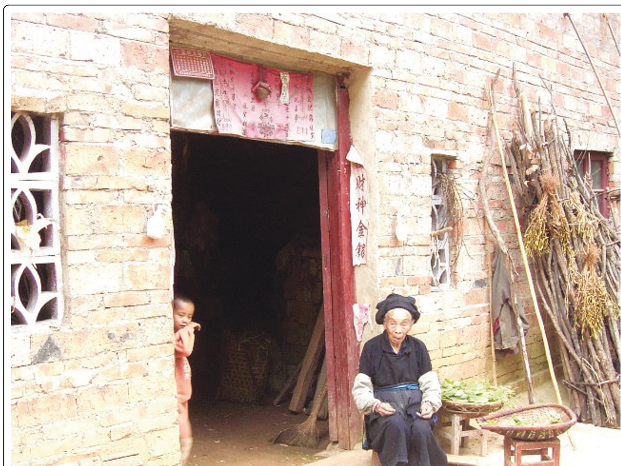
Figure 2 A village herbalist in rural Yunnan, Southern China. This lady was a key informant for an ethnobotanical study into plants used to repel mosquitoes

was originally extracted for use in perfumery, and its name derives from the French citronelle around 1858 [28]. It was used by the Indian Army to repel mosquitoes at the beginning of the 20 th century [29] and was then registered for commercial use in the USA in 1948 [30]. Today, citronella is one of the most widely used natural repellents on the market, used at concentrations of 5-10%. This is lower than most other commercial repellents but higher concentrations can cause skin sensitivity. However, there are relatively few studies that have been carried out to determine the efficacy of essential oils from citronella as arthropod repellents. Citronella-based repellents only protect from host-seeking mosquitoes for about two hours although formulation of the repellent is very important [31,32]. Initially, citronella, which contains citronellal, citronellol, geraniol, citral, \alpha pinene, and limonene, is as effective dose for dose as DEET [33], but the oils rapidly evaporate causing loss of efficacy and leaving the user unprotected. However, by mixing the essential oil of Cymbopogon