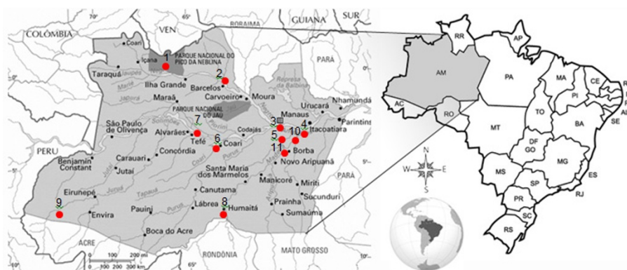
Figure 2 Map of the Amazonas State showing the municipalities where samples originated (1. São Gabriel da Cachoeira; 2. Barcelos; 3. Manaus; 4. Itacoatiara; 5. Careiro; 6. Coari; 7. Tefé; 8. Humaitá; 9. Guajará; 10. Autazes; 11. Borba).