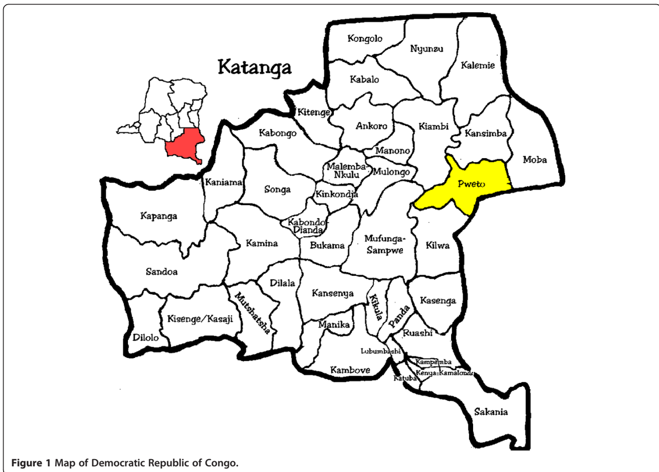
Figure 1 Map of Democratic Republic of Congo.