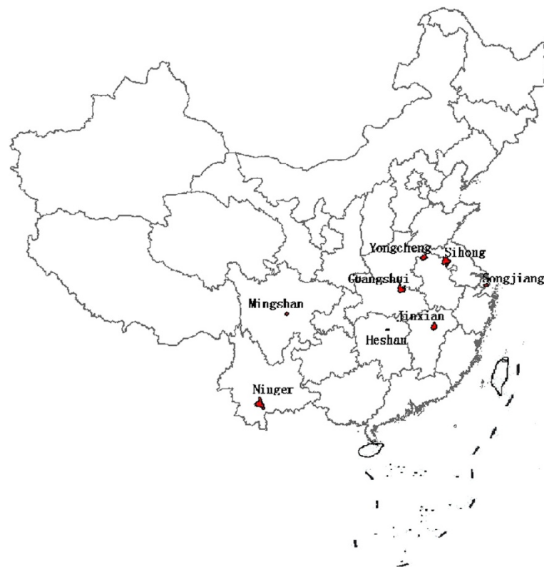
Figure 1 The sentinel sites in this study.

Two insecticides were tested: 0.25% deltamethrin and 4% DDT. Insecticide papers were obtained from the WHO reference centre in Malaysia [7]. Each batch was tested on the insecticide susceptible Jiangsu strain of Anopheles at the key laboratory in National Institute of Parasitic Diseases, Chinese Center for Disease Control and Prevention before dispatch to the participant provinces. Any batches of papers showing less than 100% mortality in these control tests were discarded. Each paper was used a maximum of six times. About 100 mosquitoes (3-5 replicates of approximately 25 mosquitoes, with tests performed over more than one day) were exposed to each insecticide for 1 hour. Mortality was recorded 24 hours after exposure. Each day a control was tested alongside the exposure tubes. The bioassay result was corrected using the Abbott formula when the control mortality was between 5 and 20%. The bioassay results were summarized in three resistance classes as defined by WHO: (1) susceptible when mortality was 98% or higher, (2) possible resistant when