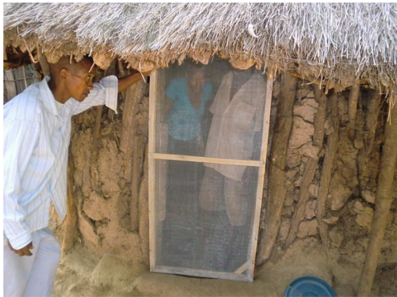
Figure 2 External view of screened door.

half gravid and gravid based on abdominal condition. Culicines were counted and discarded.