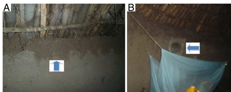
Figure 3 Openings around eaves closed by mud (A) and openings for ventilation closed by metal mesh (B).

Mosquito data within household was described by mean number of An. arabiensis per CDC light trap per night. A Generalized Estimating Equations (GEE) with a negative binomial error distribution was used to account for over dispersion of An. arabiensis and culicine counts. A first-order autoregressive correlation structure was considered to account a serial correlation between repeated catches made in the same house. The GEE was fitted separately to counts of different abdominal conditions of An. arabiensis and overall culicine to determine the protective effect of screenings against house entry of the species. The mean's ratio of mosquitoes between screened and control houses were used to determine the percentage reduction of house entry. Non-parametric correlation was used to see the house entry patterns of An. arabiensis in pre-intervention and post-intervention months. All houses were included in analysis because no damaged metal mesh and malfunctioned CDC light traps were observed. The statistical significance of screening effect was tested by P-value obtained from GEEs at 0.05 level. IBM SPSS version 20 (SPSS Inc, Chicago, USA) was used for data entry and analysis.