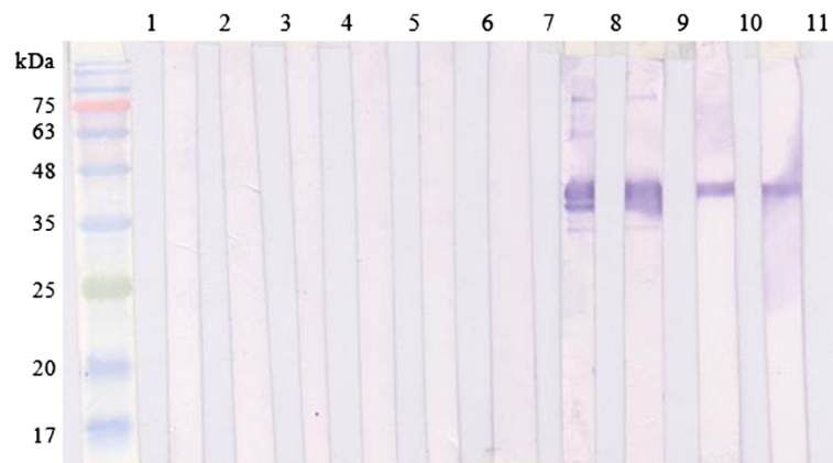
Figure 2 Anti-pkMSP-1 42 antibody detected in pkMSP-1 42 -immunized mice. Lanes 2–6, sera of mice injected with non-recombinant protein pRSET A at day 0, 7, 14, 21 and 31 post-immunization; lanes 7–11, sera of mice injected with purified pkMSP-1 42 at day 0, 7, 14, 21 and 31 post-immunization. Lane 1 contained protein size standards.

microheterogeneity comprising amino acid substitutions causing different alleles was observed in P. knowlesi MSP-1 33 epitopes [45]. Presence of sequence diversity in these epitopes may alter the immunological recognition of the epitopes and hence benefit the parasite survival by evasion of host immune response. For instance, Bergmann-Leitner et al. demonstrated that the P. falciparum anti-MSP-1 19 antibodies were allele-specific during inhibition of merozoite invasion and parasite growth [46]. Therefore, antibodies in some of the malaria infected patient sera in the present study could be unable to detect the variant epitopes on pkMSP-1 42 , which led to negative reactivity.