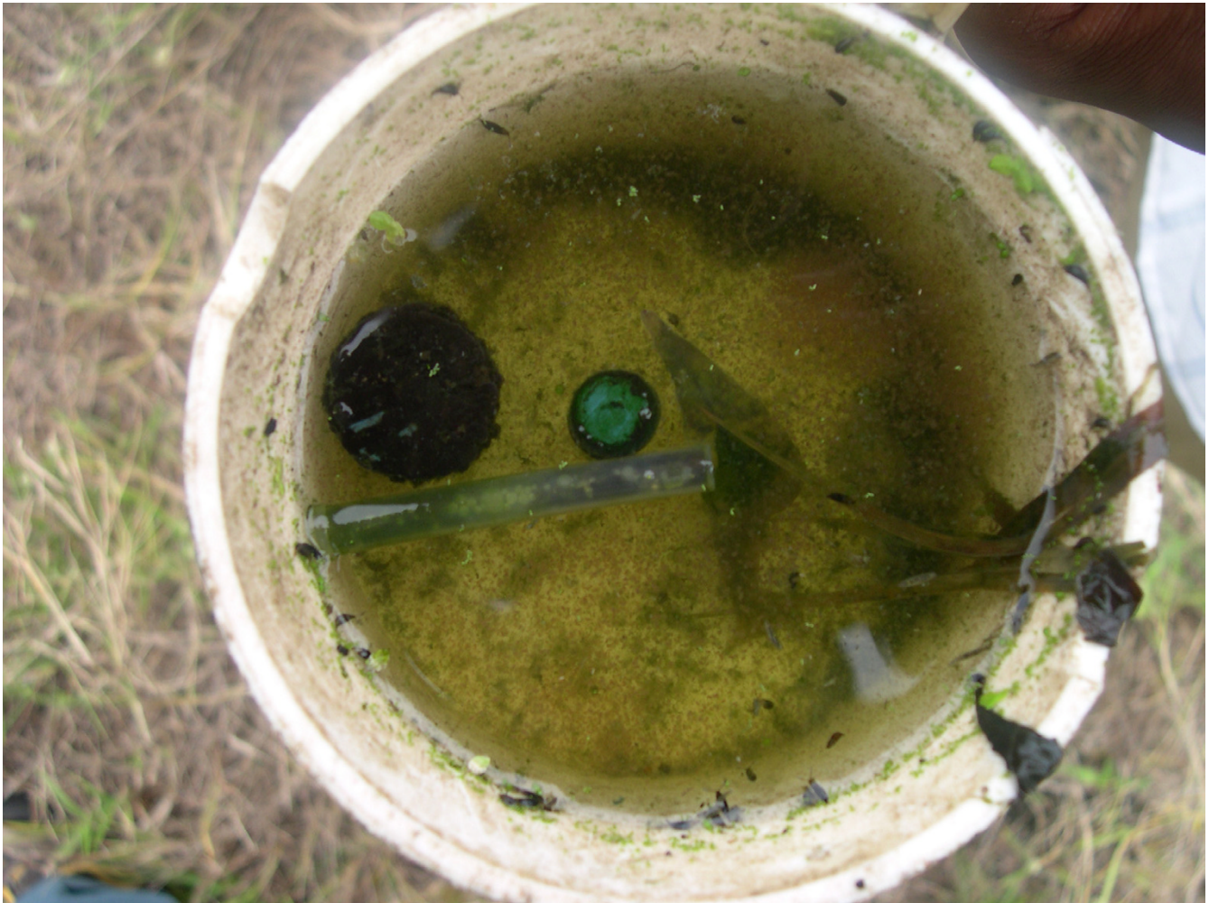
Figure 4 Dipper content from sewage pond in Temeke municipality (Figure 3).