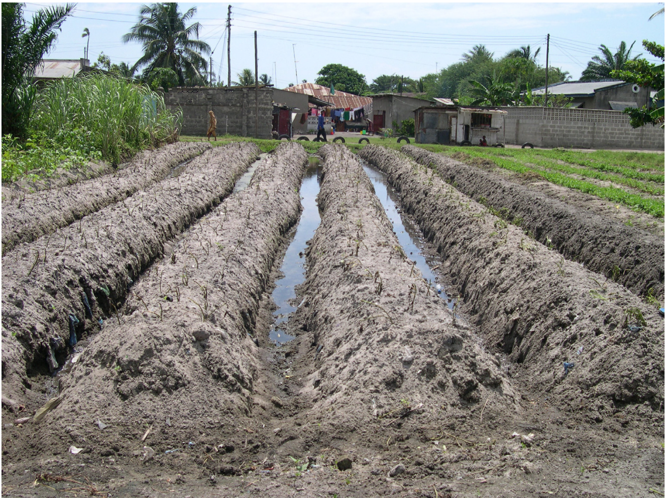
Figure 5 "Matuta" type of agriculture in Dar es Salaam, Tanzania.

potentially important for mosquito control interventions. Further, mosquitoes do not necessarily lay eggs every day in each potential breeding site, thus the reason why a site did not contain larvae could simply be because no eggs were deposited within the last week.