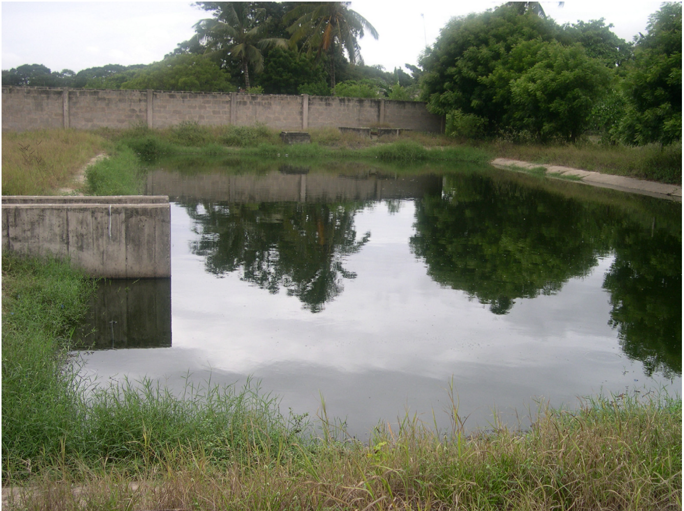
Figure 3 Sewage pond in Temeke municipality, Dar es Salaam, Tanzania.