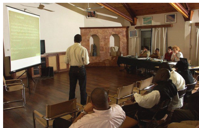
Figure 1 Presentations to the panel. Footnote: The presentations are given at the end of the week, in front of the other participants and the panel, composed of tutors. These sessions allow the participants to demonstrate their acquisitions, by defending their approach, and aim to evaluate the work done during the week (Photo: courtesy of Dr Olivier Domarle, Atelier Paludisme 2006).

Details concerning the timetable for this course are published on the course website [1].