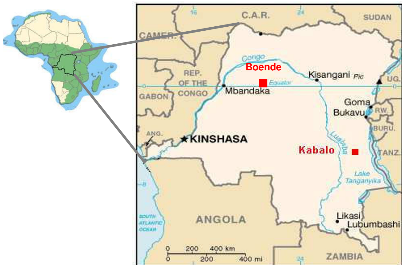
Figure 1 Location of study sites.

The first study was located in Boende, Equatorial province, in the northwest of the country and the second study in Kabalo, Katanga province, in the southeast of DRC (Figure 1). Malaria is endemic in DRC with perennial transmission in Boende and seasonal transmission in Kabalo, with a peak between November and May. The ethics committee of the NMCP of the Democratic Republic of Congo approved the two studies. The ethics review board of Médecins Sans Frontières also reviewed the study protocol for Kabalo. Written informed consent was obtained from children's carers before enrolment.