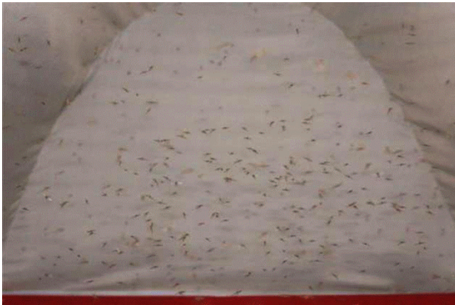
Figure 3 Adult An. arabiensis swarming. The effectiveness of the artificial horizon in the cage shown in Figure 2 is seen by swarming occurring during an artificial dusk.

In previous mosquito release programmes, measures for disease control have been conducted without knowledge of potential pathogens in the colony. Given the paucity of information, past experiences with pathogens in mosquito mass-rearing systems are encouraging. For instance, mass rearing of An. albimanus in the early stages in El Salvador was fraught with a high number of "bad trays" (10%-16%) from which few or no pupae were harvested. Often these trays exhibited lack of synchrony in development and foul-smelling water suggesting that improper amounts of diet were provided. Later, when the rearing was increased to one million male pupae per day, losses were reduced to around 1%. In both circumstances, eggs were cleaned simply by washing with water, which apparently sufficiently reduced Nosema and/or other surface contamination.