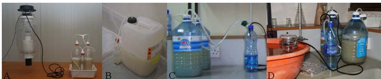
Figure 1 Pictures showing the different setups used to apply the yeast-sugar solutions and to measure the CO 2 production. A. Two 1.5 L bottles; B. One 25 L container; C. Two 5 L bottles; D. CO 2 production measurement.

filter and orifice removed) and the Luer connection at the underside of the trap's top lid. The connections were sealed by Teflon tape and held under water to check for leakage. Several combinations of bottle size and amount of yeast, sugar and water were used. The carbon dioxide output was estimated by measuring the volume of water displaced from a submerged measuring cylinder (Table 1). For this purpose, the tubing that was attached to the MM-X traps during the mosquito trapping experiments was now led into a measuring cylinder which was held in a bucket of water (Figure 1D).