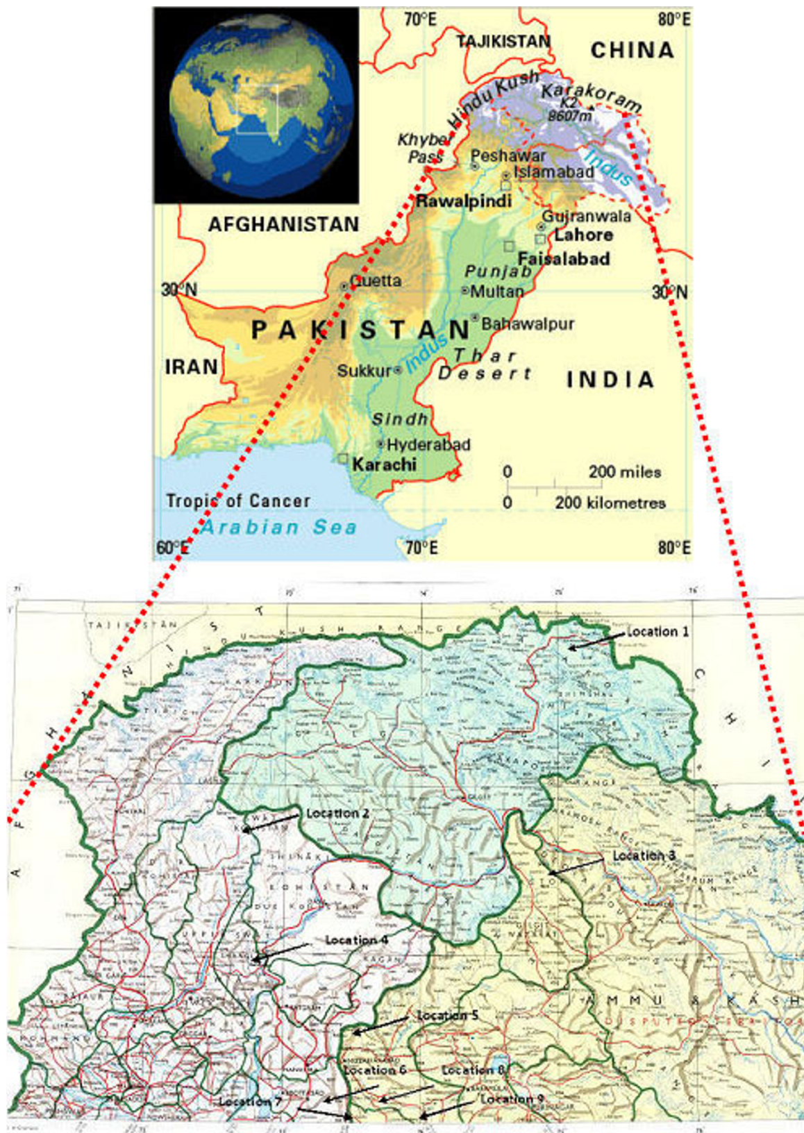
Figure 2 Geographical map of Northern Pakistan showing different locations of collection of Artemisia species.