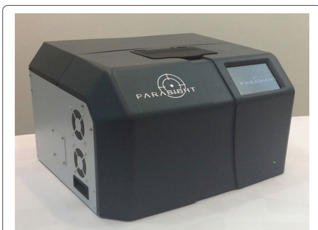
Fig. 1 The SightDx P1 Device. A compact platform for malaria diagnostics

SightDx sensitivity and specificity compared to microscopy were found to be 94.4 % (95 % CI 90.9–97.8) and 95.6 % (95 % CI 92.7–98.6), respectively (Table 1).