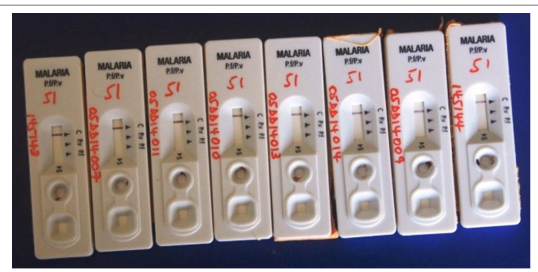
Fig. 2 Some of the false negative results of malaria RDTs

The joint assessment with the manufacturer of five P. falciparum patients yielded the following results. A known positive control, prepared at 2000 parasites/µl, gave positive results when tested against all SD Bioline HRP2Pf/Pv RDTs whether they were retained with the manufacturer or those distributed to the field in Eritrea. However, the five malaria patients (all were microscopy confirmed P. falciparum -infected) could not be detected by all the RDTs, except with SD Pf/Pan type where the Pan-line band only turned positive to each of the specimens (Table 2). All the microscopically confirmed cases were also re-confirmed by PCR by SD at the manufacturing facility.