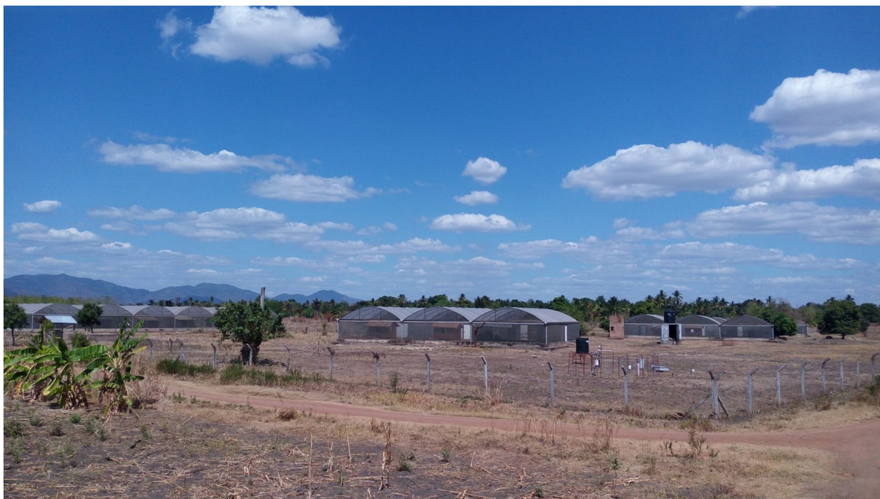
Fig. 2 The Mosquito City: a pictorial illustration of the semi-field facilities at Ifakara Health Institute, in Tanzania, where new vector control products are evaluated before they are taken for full-field studies. The eave tube technology was initially tested here, against self-sustaining colonies of the malaria vector, Anopheles arabiensis , in an ecosystem mimicking rural African villages. The model village had houses built to mimic both modern and traditional designs, human volunteer sleepers working at night, cattle, model rice fields, multiple forms of vegetation, as well as insecticide treated bed nets, the primary malaria intervention already widely used in local villages

empty eave tubes without any netting, mosquito house entry could be reduced by approximately three quarters. An obvious interpretation here is that with regard to household-level protection, most of the overall benefits of the eave tubes approach are accrued from the physical blocking of the eave spaces, and screening of the windows. The main benefit of adding the insecticidal inserts is, therefore, the extra-communal benefits associated with mass killing of mosquitoes. Indeed, the investigators also demonstrated equivalent or greater reduction of vector densities indoors and in peri-domestic spaces when eave tubes were used relative to when LLINs were used, demonstrating potential of the technology for both household level and communal protection [17]. The eave tubes used in these tests were fitted with insecticidal nets cut from commercially available LLINs, or nets treated with bendiocarb (a carbamate insecticide), the latter providing marginally higher protection than LLINs.