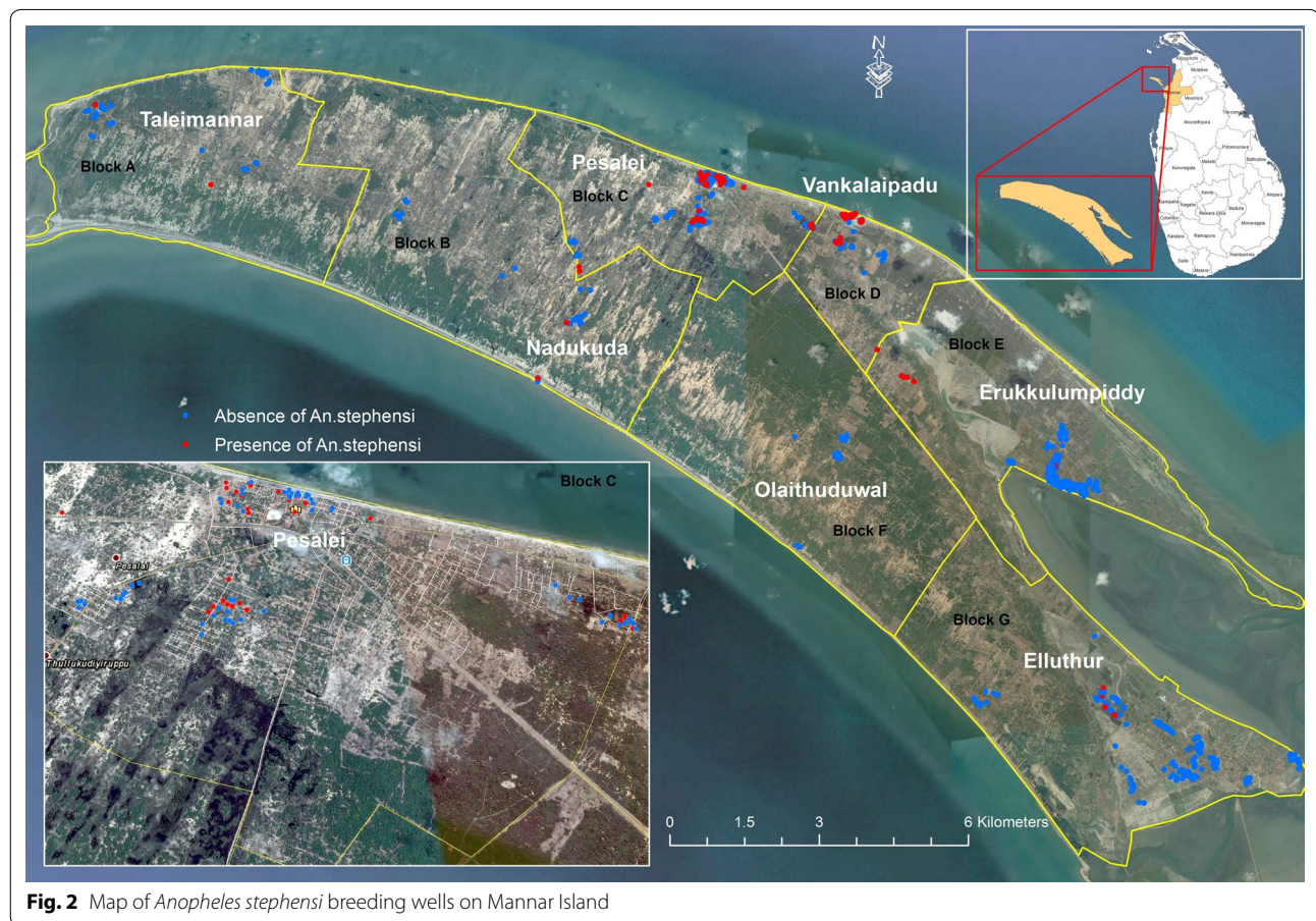
Fig. 2 Map of Anopheles stephensi breeding wells on Mannar Island

Similarly, An. stephensi in Mannar Island breeds in water storage containers, mainly in domestic wells with cemented walls, where the highest percentage of breeding was recorded. Further co-existence of An. stephensi