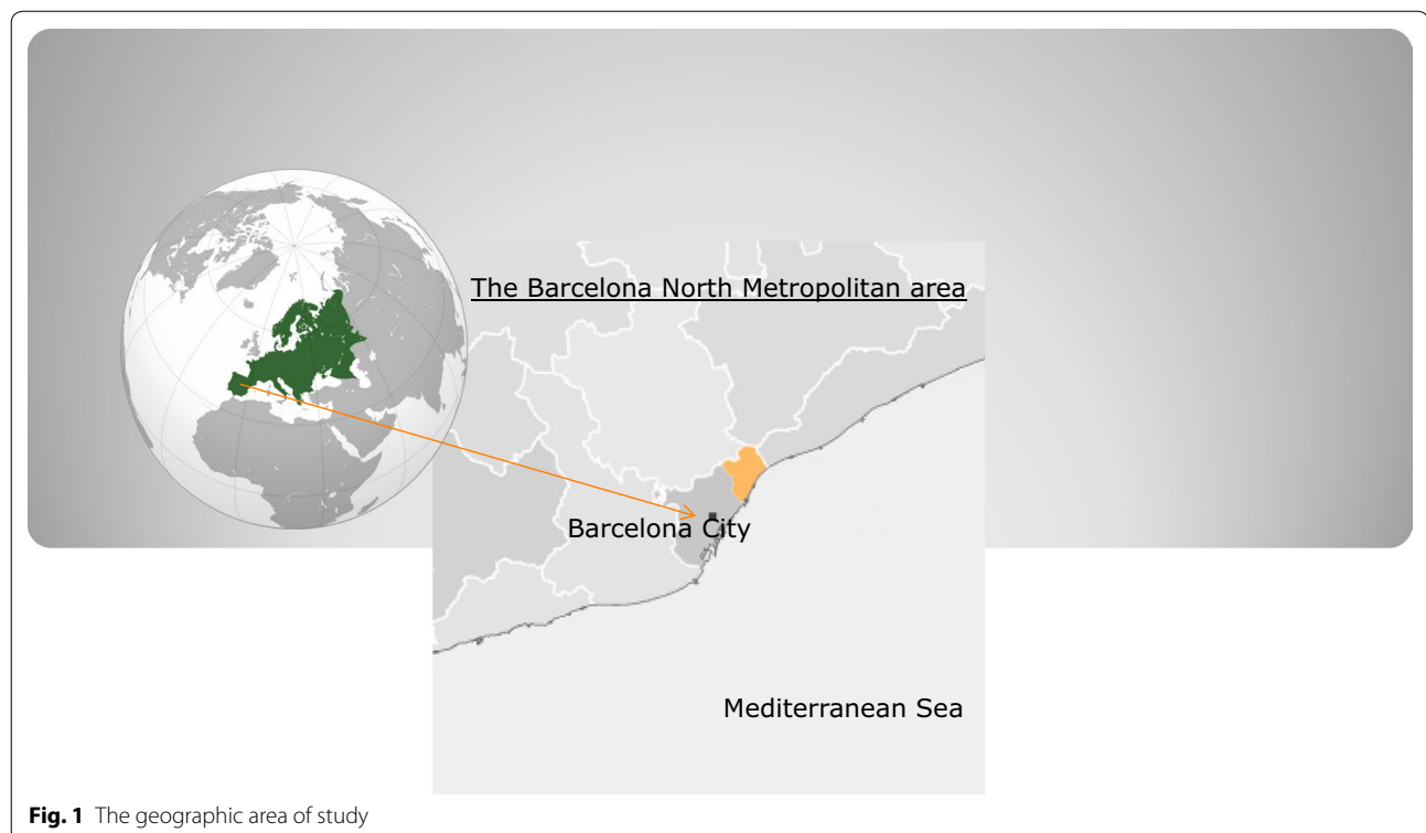
Fig. 1 The geographic area of study

All these health facilities belong to the public Catalan Health Service in the frame of the PROSICS and, therefore, the medical visits are easily accessible and free of charge. Likewise, the territorial International Health Unit (conducting pre-travel preventive activities and being by far the main responsible of anti-malarial