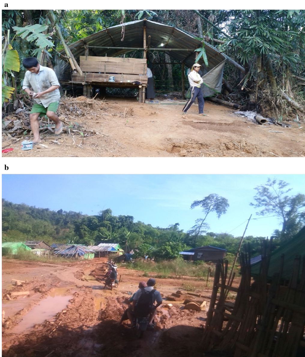
Fig. 3 a, b Living conditions of mobile/migrant workers

labour, such as charcoal making, bamboo cutting, and fishing. Their nature of worksite, worksite relations, favourable living conditions (housing, clean water, and sanitation), and the availability of seasonal earning opportunities, provoked variations in duration of stay, periodic migration patterns, and primarily circular/cyclic movements.