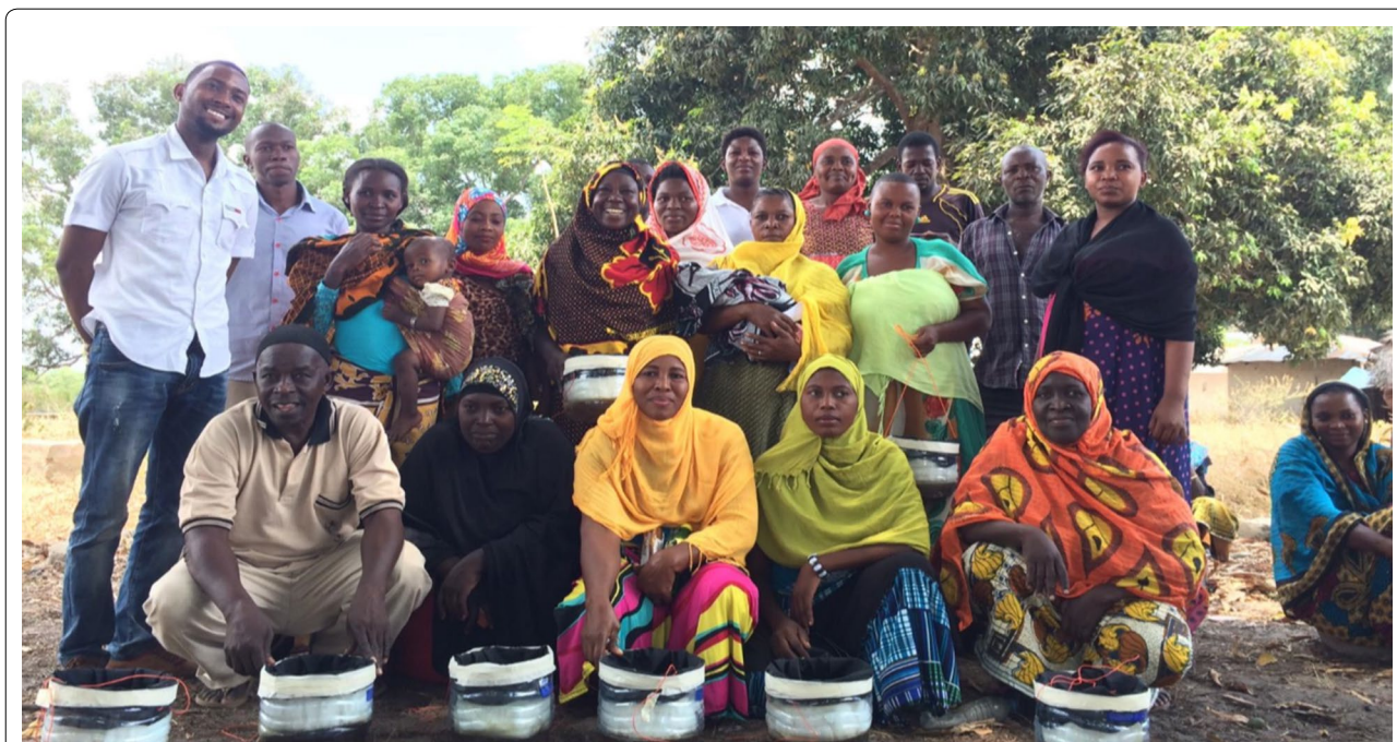
Fig. 1 Group of participants who joined sensitization meeting in Kiromo. In front of them are the ATSBs

Sensitization meetings were held in each village before distributing the ATSBs. During the meetings communities were introduced to the concept of attracting mosquitoes to sugar-feed to kill them and were explained how the ATSB worked. All questions, concerns and opinions were answered and recorded. During sensitizations, participants were shown how the bait could be made using basic materials commonly found in household waste. Materials used included: a plastic water bottle (12 L) cut