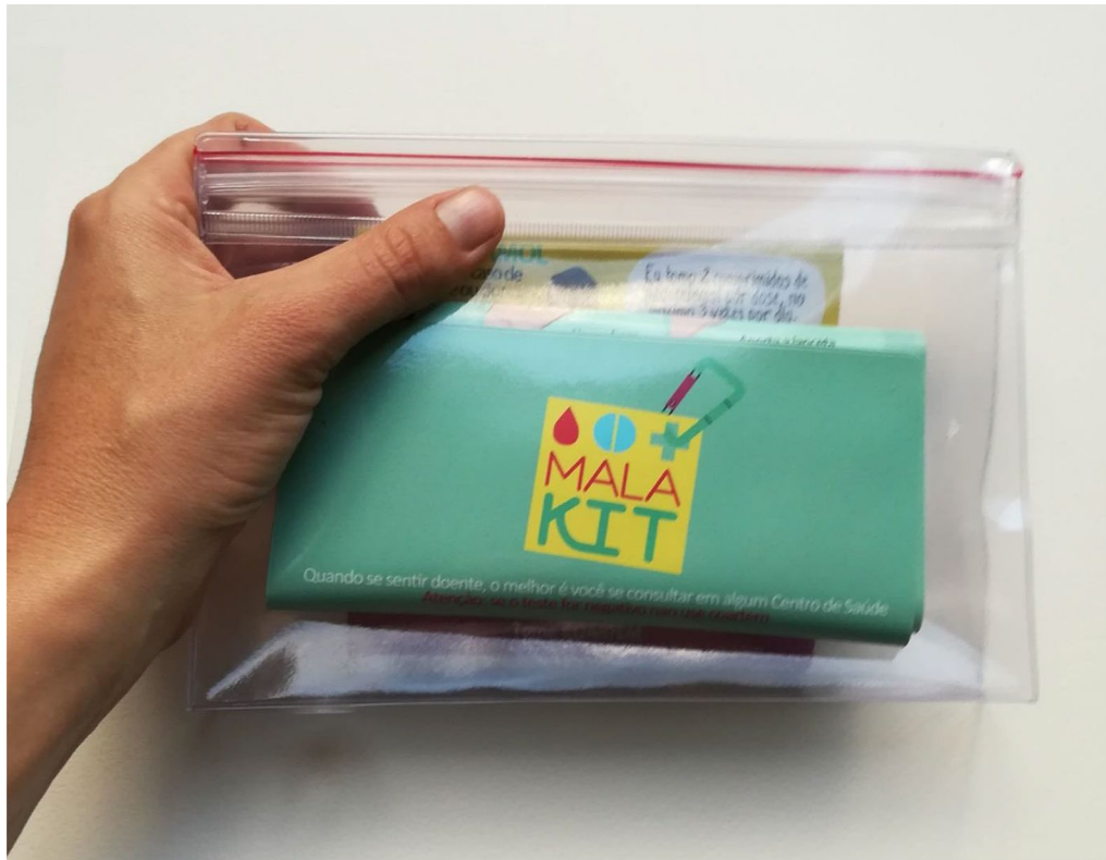
Fig. 2 Self-diagnosis self-treatment kits

potential interactions with cardiac treatments, and the insufficiency of drug absorption in case of vomiting. In those cases, participants will be invited to start the treatment and rapidly consult at a health centre. The clinical signs have been defined by the Malakit scientific committee in a way that should easily be recognizable by participants. Women will be informed that in case of pregnancy, they should not take primaquine, and that a medical consultation is recommended.