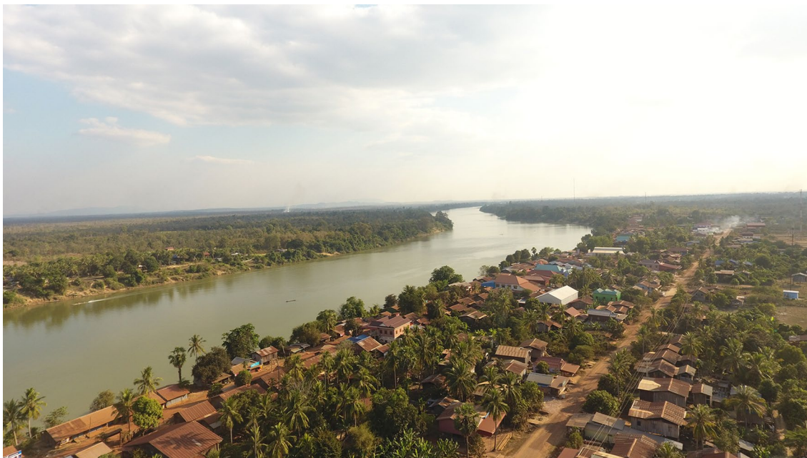
Fig. 2 Aerial image of Siem Pang town and surroundings

timing, nature). Subsequently, during the process of coding, themes that emerged from the data were incorporated into the codebook. Patterns across responses were identified for example, regarding the impact of village location or ethnicity on the nature of forest work or experiences with malaria treatment.